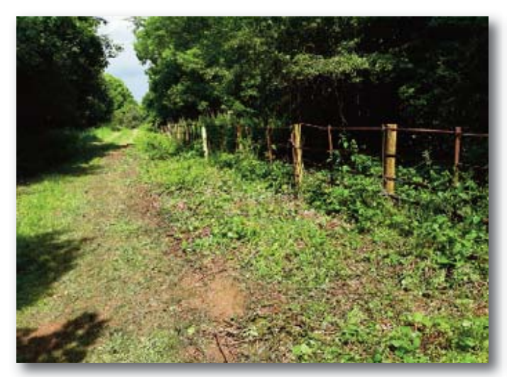
Repair of the metal gate, supervised by our Treasurer ...

Late summer saw a new FoLW objection to yet another proposed planning application for the development encroaching on the tranquility of the woods, on land beside Soulbury Road/Leighton Road. This is an on-going process linked with the CBC Local Plan.